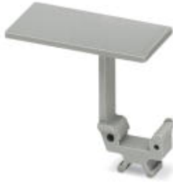
Group marker label, snaps onto terminal center for screw, spring-cage and quick connection terminal blocks, labeled with a 25 x 12 mm label or manually with the B-STIFT, in the foot part with ZB 5

Please be informed that the data shown in this PDF Document is generated from our Online Catalog. Please find the complete data in the user's documentation. Our General Terms of Use for Downloads are valid ( http://download.phoenixcontact.com )